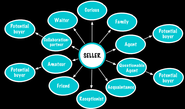
Information flow without multiexclusivity.